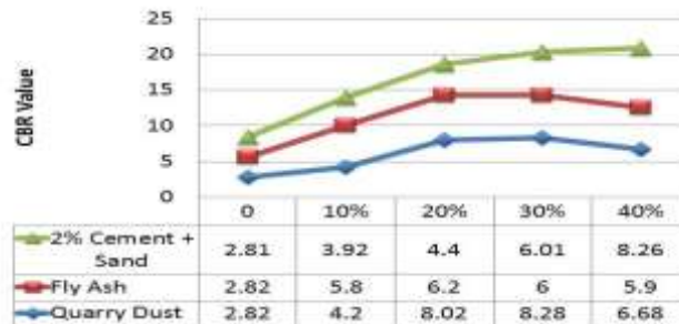
Figure I Comparison of Test Results

As shown in figure I, quarry dust gives its best results at 30%, fly ash at 20% and 40% sand with 2% cement gives best results. This test conducted on the same sample of black cotton soil. Therefore, according to test results Cement and Sand, and Quarry dust is most suitable methods for soil stabilization.